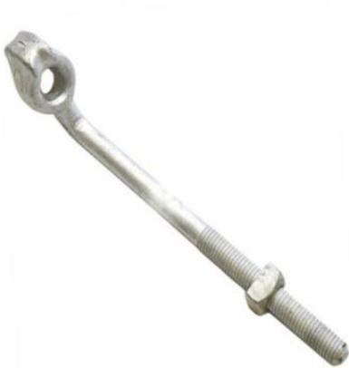
Thimble eye bolt(elbow)